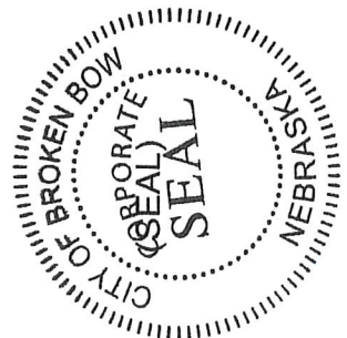
_____ City Administrator City of Broken Bow, Nebraska